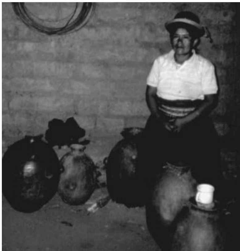
Figure 8.2. A woman with a set of typical household chicha storage vessels in the Cotahuasi Valley of southern Peru.

Chicha brewing is primarily a female activity (Allen 2002: 152; Camino 1987: 39–42; Cutler and Cárdenas 1947: 37; Gómez Huamán 1966: 35; Holmberg 1971: 200; Orlove and Schmidt 1995: 276; Perlov, this volume;