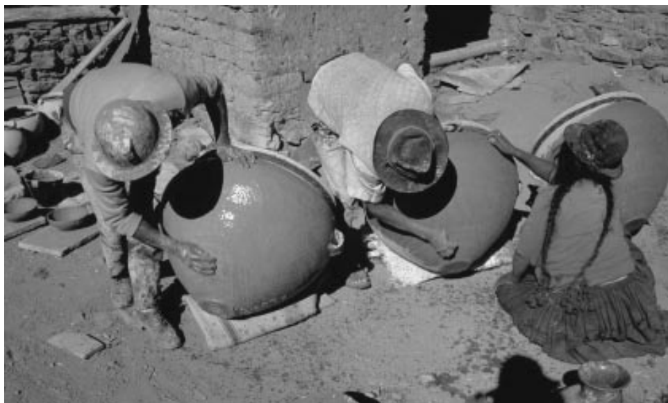
Figure 8.1. Itinerant potters from the community of Pumpuri, Bolivia, burnishing wide-mouth jars.

Weisse 1980), most domestic potters of the central Andes use a coil method of vessel formation followed by a scraping finishing technique (Sillar 2000: 55–58). Households produce a wide variety of vessel forms, with the pots finished, dried, and decorated in and around the home, and then fired in an open fire nearby (Fig. 8.1).