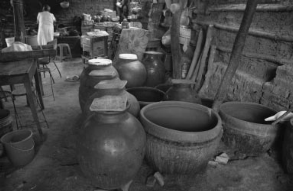
Figure 8.3. Fermenting jars used by a chichera on the north coast of Peru to brew a total batch of about 600 liters.

A lone woman, perhaps with the help of her children, must also be able to manipulate the pots after they are fired, because men and adolescents are frequently away from the home throughout the day in the central Andes (Allen 2002: 60; Weismantel 1988: 175). During the brewing process, the rakis need to be tipped over and picked up several times. While an adult woman would have no problem lifting a 40 liter-capacity pot, she would likely struggle with the same pot while straining the liquid and transferring the chicha into fermenting jars. Since a liter of water weighs one kilogram, the woman would have to be able to tilt a vessel weighing more than 50 kilograms (not including the weight of the maize). An 80 liter-capacity vessel containing chicha would weigh more than 100 kilograms, and manipulating the vessel might necessitate help from other family members. Chicheras require the help of at least one to two other people to use their larger vessels (Nicholson 1960: 296; Perlov, this volume). A woman and her small children, however, must be able to handle chicha brewing alone, along with all other household tasks (Fig. 8.3).