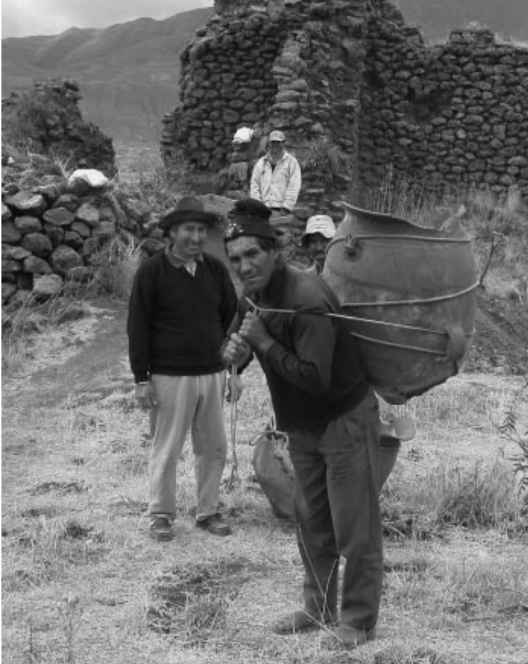
Figure 8.5. An excavator carries an Inca-period raki from the site of Choquepuquio in southern Peru. The vessel's volume is approximately 120 liters.

consumed at Inca feasts (Costin 2001: 235; Morris and Thompson 1985: 90). 3 Since chicha spoils quickly, production at these specialized facilities was probably episodic (Goldstein 2003: 162; Shimada 1994: 244), and labor was pooled only in the weeks preceding a feast. Nonetheless, we suggest that the presence of these facilities signals a sharp departure in feasting patterns. With larger pots, less community involvement was needed (see Fig. 8.3).